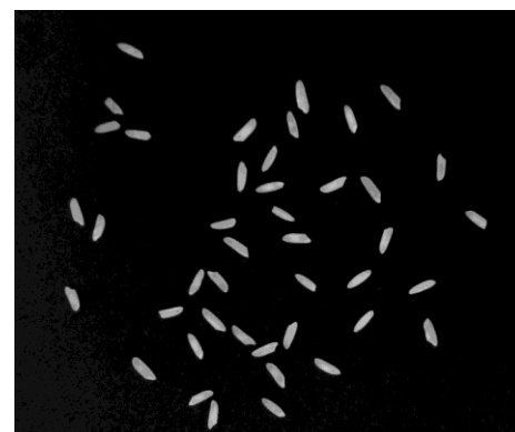
Fig. 3. Grayscale image of the sample.

The aim of pre-processing is an improvement of image data that suppresses unwanted distortion or enhances some image features for further processing. For human viewing, Image Enhancement improves the quality and clarity of images. Removing noise and blurriness, rising contrast and enlightening details from images are example of enhancement operation. Noise tends to attack images when picture are taken in low light setting. While capturing the image, sometime it has been distorted and hence image is to be enhanced by applying special median filtering to the image to remove noise. Here, Median filter is used for smoothing because it protect the edges of the image during noise removal and is mostly used in digital imaging and effective with salt and pepper noise and speckle noise. The noise in the input gray color image is detached using median filter. Now convert the High Quality Image into Grayscale Image. Image was pre-processed by removing the background and adjusting the contrast of the image. Most of these operations compute result based on weighted sum of a pixel value and its neighbours values.