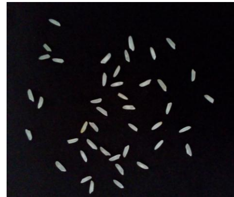
Fig. 2 Captured image of a sample.

Take a high quality image of basmati rice sample with the help of high quality camera \ scanner. A black sheet was used which gives the black background to the image which helps in parameter extraction from the image. Input the image into the system. The interface between the Camera/scanner and PC is provided through USB Cable.