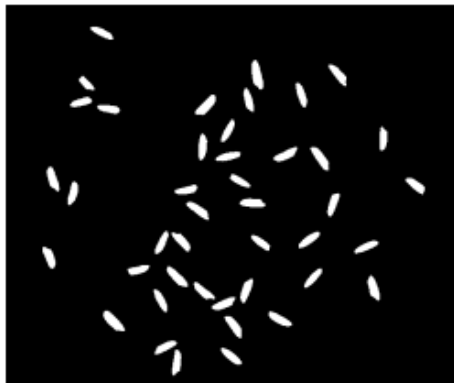
Fig. 3.4. Binarized Image of the sample.

The binarization process converts the grayscale image into two values 0 and 1. The simplest method of image segmentation is called the thresholding method. The subsequent step is to segment an image which is one of the imperative stages in image analysis. By using threshold value, image binarization is performed. Threshold is used to separate the region in an image with respect to the object, which is to be analyzed and this is based on the variation of intensity between the object pixel and background pixel. In general, these values are zero and the maximum value in the image.